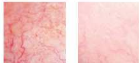
Dilated blood vessels – the effect before and after application of serum.