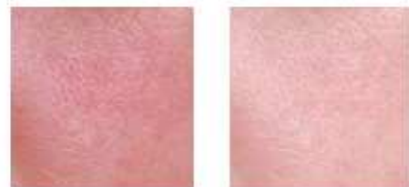
Redness – the effect before and after application of serum.